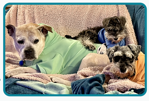
Host dogs, Iris, an AmbullStaff female, 14 (left), Davy, a Mini Schnauzer male, 2, (right), Dolly, a Mini Schnauzer female, 1, (top)

Please arrive on time, and if you can't, please text to let me know when, so I can ensure any dogs here are relaxed and ready.